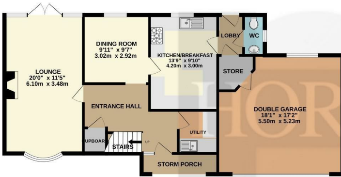
GROUND FLOOR 997 sq.ft. (92.6 sq.m.) approx.